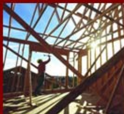
For Trade Allies